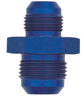
FLARE REDUCER SIZE