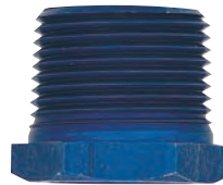
PIPE BUSHING REDUCER MALE TO FEMALE