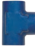
FEMALE PIPE TEE