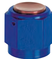
THREAD SIZE 37° FLARE CAP FEMALE