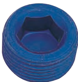
PIPE SIZE ALLEN SOCKET PLUG QTY