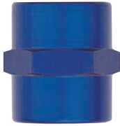
PIPE SIZE FEMALE PIPE COUPLING