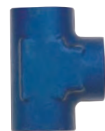
FEMALE STRT THREAD AN TEE O-RING BOSS