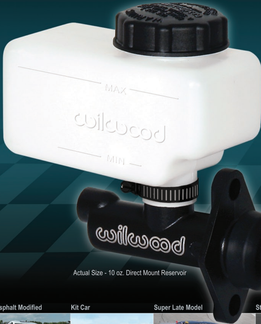
Actual Size - 10 oz. Direct Mount Reservoir